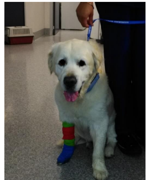
Boon ready to go with his multi coloured leg, he still had his catheter in!