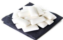
Sugar free gum